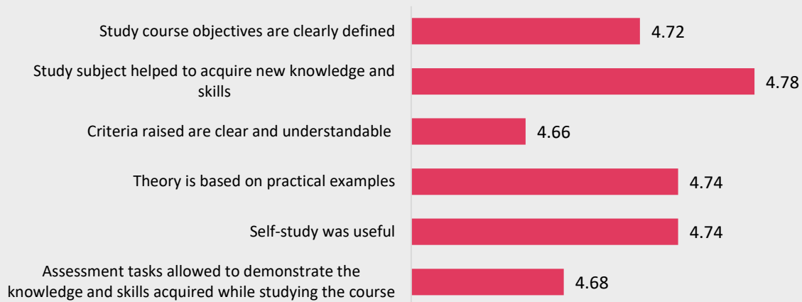
Figure 1. Evaluation of the content quality of the course units taught in the Pharmacy techniques study programme according to the criteria (averages).

than 4 points out of 5). Most respondents agree with statements that the study subject helped to acquire new knowledge and skills (4,79) and that theory is based on practical examples and that self-study was useful(4,74). The least respondents agree with the statement that self-raised criteria are clear and understandable (4,66) (see Figure 1).