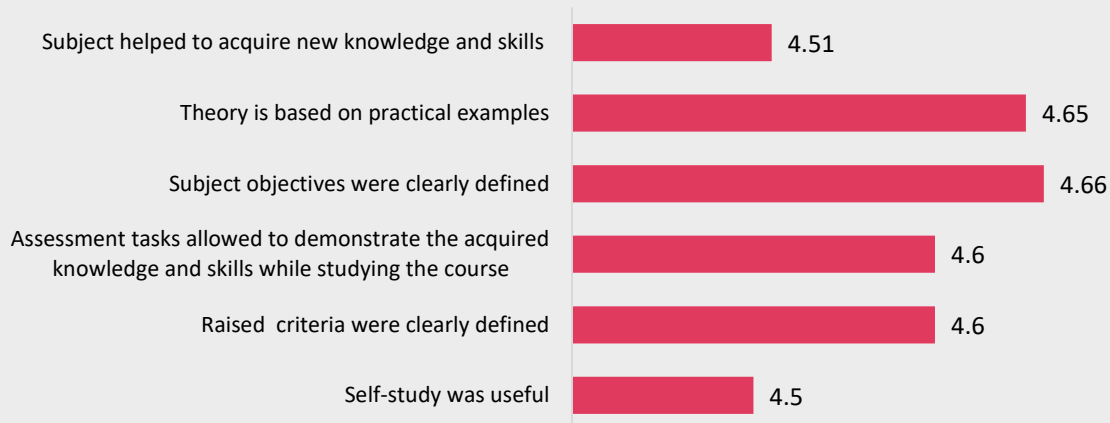
Figure 1. Evaluation of the content quality of the course units taught in the General Practice Nursing study programme according to the criteria (averages).

Note: „Likert“ scale average is presented.