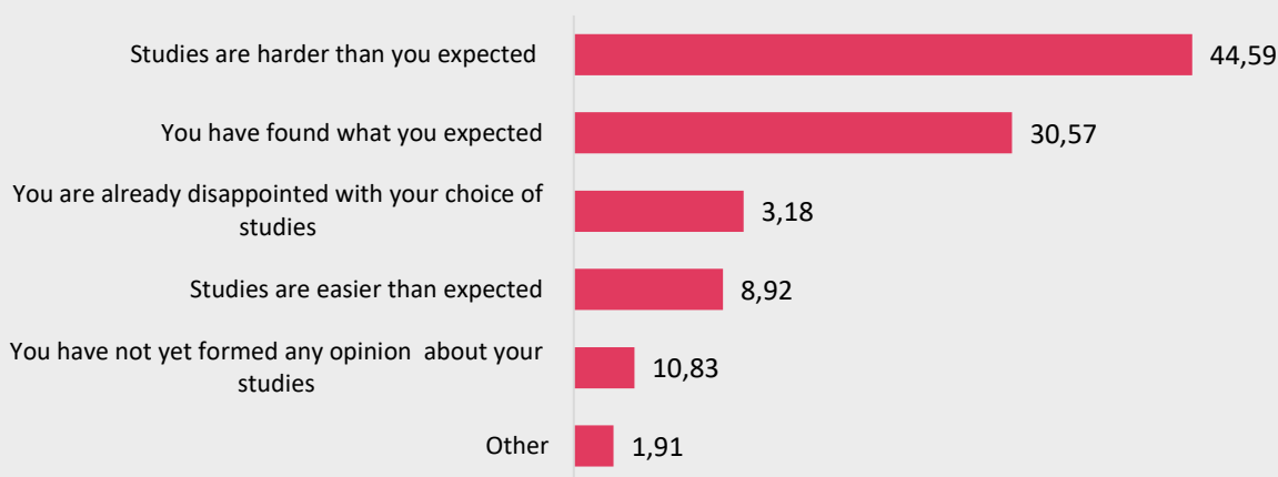
Figure 1: 1st-year students of the Faculty of Medicine opinion about studies after starting studies at KK (per cent)

RESULTS: The overall return rate was 157 (37,38 pct.). To summarise, almost half of the first-year students of the Faculty of Medicine claim that studying at KK is more complicated than they expected before their studies (44,59%). In contrast, almost a third of the respondents claim they found what they expected (30,57%) ( see Figure 1 ).