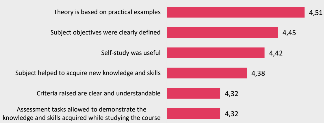
Figure 1. Evaluation of the content quality of the course units taught in the Midwifery study programme according to the criteria (averages).

Note: „Likert“ scale average is presented. The higher the average, the more respondents agree with the statements