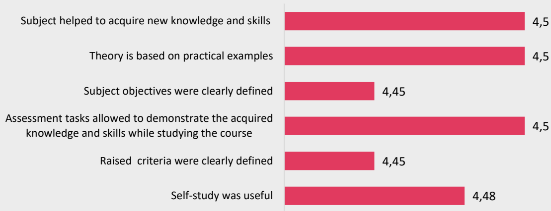
Figure 1. Evaluation of the content quality of the course units taught in the Physiotherapy study programme according to the criteria (averages).

Note: „Likert“ scale average is presented. The higher the average, the more respondents agree with the statements+