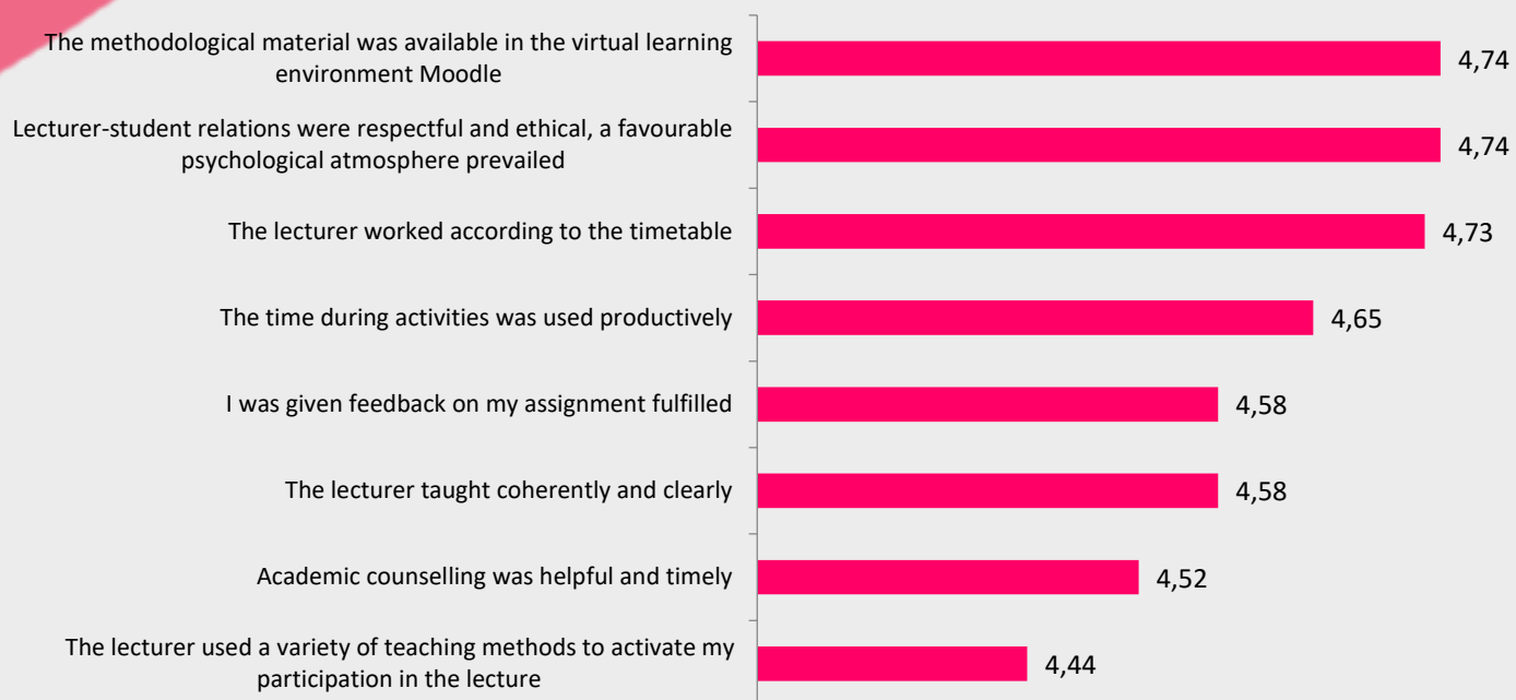
Figure 2: Evaluation of the quality of teaching course units taught in the study programme of Biomedical Diagnostics according to the criteria (averages)