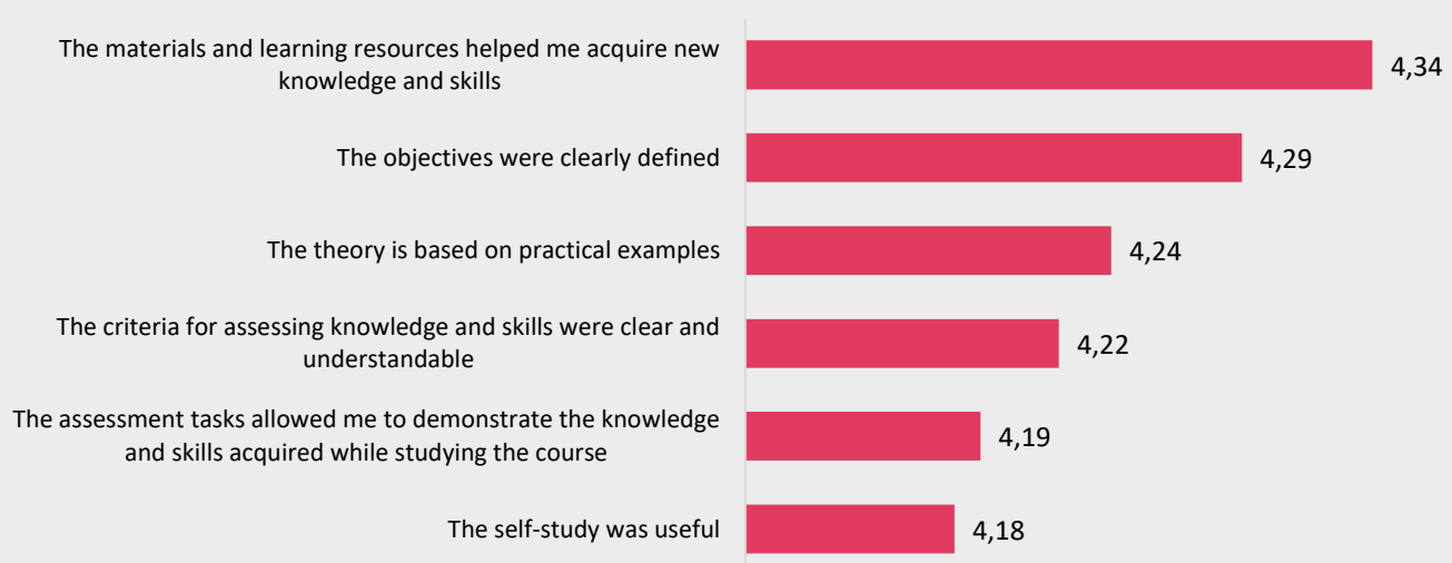
Figure 1: Evaluation of the quality of the content of the course units taught in the study programme of Occupational therapy according to the criteria (averages)

RESULTS: The summarised results reveal that the quality of the content of the courses studied in the study programme of Occupational therapy is highly rated in all the 6 criteria (averages are higher than 4 out of 5 points) (see Figure 1).